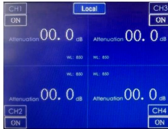
4 channel multi-mode with power-control